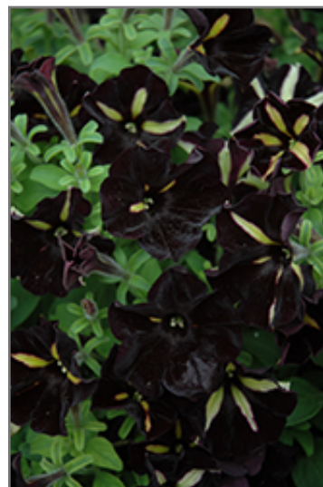
Phantom Petunia flowers