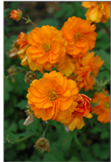
Fire Storm Avens flowers