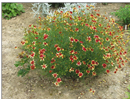
Route 66 Tickseed