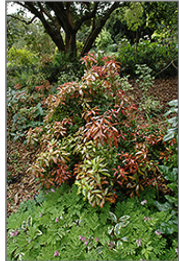
Mountain Fire Japanese Pieris

This shrub does best in full sun to partial shade. It requires an evenly moist well-drained soil for optimal growth, but will die in standing water. It is very fussy about its soil conditions and must have rich, acidic soils to ensure success, and is subject to chlorosis (yellowing) of the foliage in alkaline soils. It is somewhat tolerant of urban pollution, and will benefit from being planted in a relatively sheltered location. Consider applying a thick mulch around the root zone in winter to protect it in exposed locations or colder microclimates. This is a selected variety of a species not originally from North America, and parts of it are known to be toxic to humans and animals, so care should be exercised in planting it around children and pets.