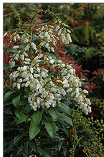
Mountain Fire Japanese Pieris flowers