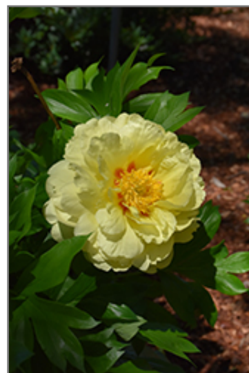
Bartzella Peony flowers