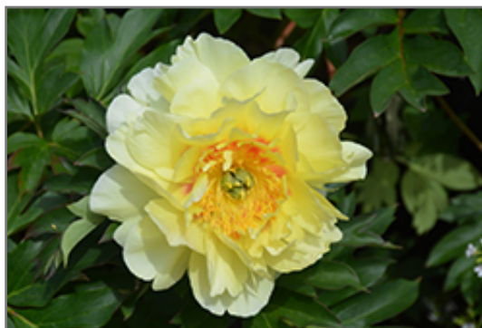
Bartzella Peony flowers