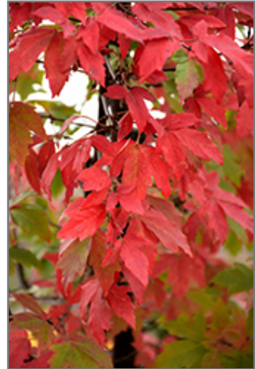
Paperbark Maple in fall

This tree does best in full sun to partial shade. It prefers to grow in average to moist conditions, and shouldn't be allowed to dry out. It is not particular as to soil type or pH. It is somewhat tolerant of urban pollution. This species is not originally from North America.