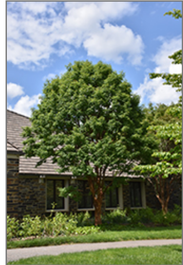
Paperbark Maple

Paperbark Maple will grow to be about 30 feet tall at maturity, with a spread of 25 feet. It has a high canopy with a typical clearance of 6 feet from the ground, and should not be planted underneath power lines. As it matures, the lower branches of this tree can be strategically removed to create a high enough canopy to support unobstructed human traffic underneath. It grows at a slow rate, and under ideal conditions can be expected to live for 80 years or more.