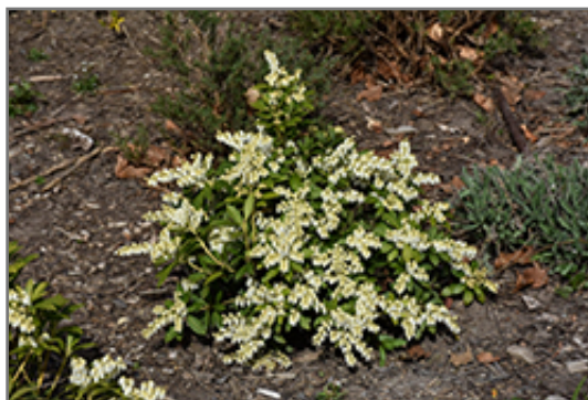
Cavatine Dwarf Japanese Pieris in bloom