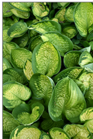
Rainforest Sunrise Hosta foliage