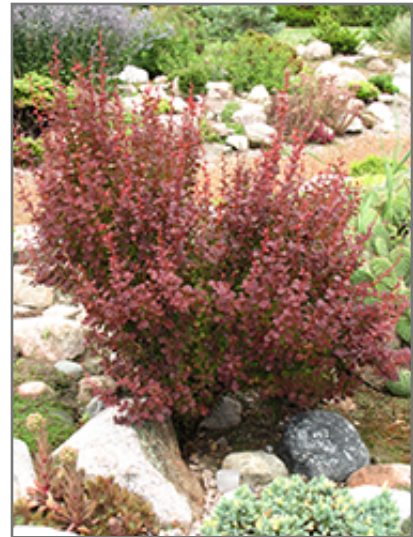
Orange Rocket Japanese Barberry

This shrub does best in full sun to partial shade. It is very adaptable to both dry and moist growing conditions, but will not tolerate any standing water. It is considered to be drought-tolerant, and thus makes an ideal choice for xeriscaping or the moisture-conserving landscape. It is not particular as to soil type or pH, and is able to handle environmental salt. It is highly tolerant of urban pollution and will even thrive in inner city environments. This is a selected variety of a species not originally from North America.