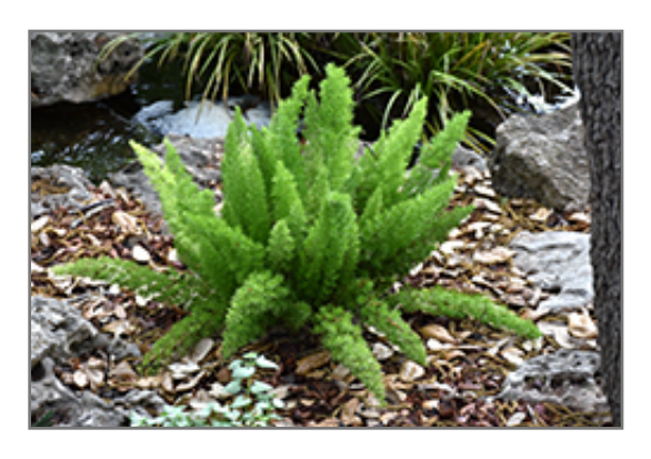
Myers Foxtail Fern