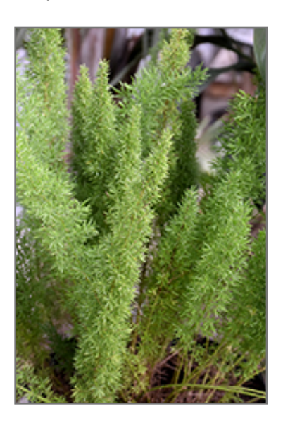
Myers Foxtail Fern foliage