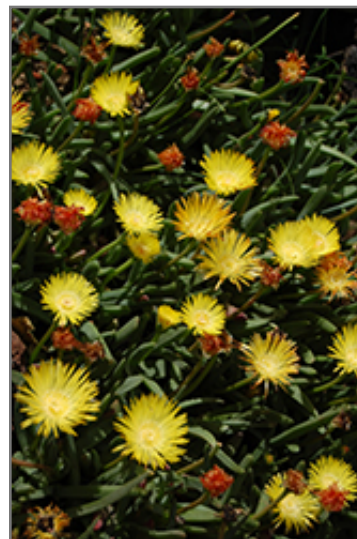
Yellow Ice Plant flowers