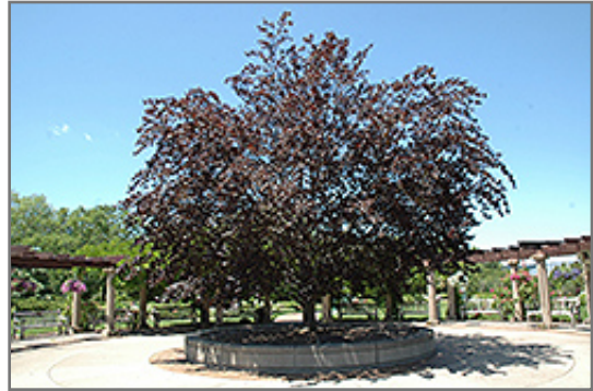
Purple Beech