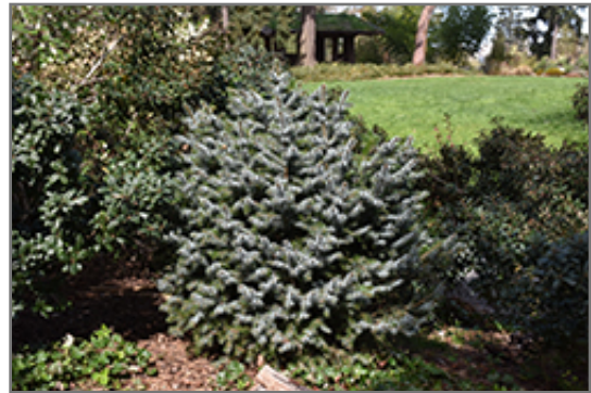
Papoose Dwarf Sitka Spruce