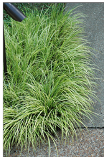
Grassy-Leaved Sweet Flag

Grassy-Leaved Sweet Flag is a fine choice for the garden, but it is also a good selection for planting in outdoor pots and containers. It is often used as a 'filler' in the 'spiller-thriller-filler' container combination, providing a canvas of foliage against which the larger thriller plants stand out. Note that when growing plants in outdoor containers and baskets, they may require more frequent waterings than they would in the yard or garden.