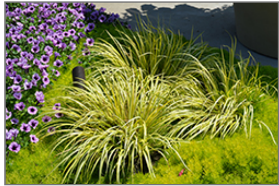
Grassy-Leaved Sweet Flag