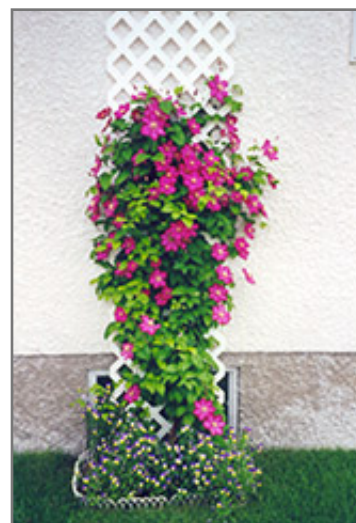
Ville de Lyon Clematis in bloom