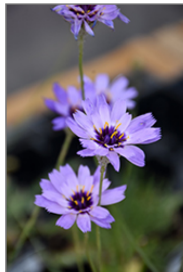
Cupid's Dart flowers