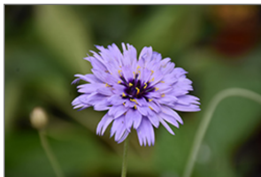
Cupid's Dart flowers