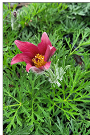
Red Pasqueflower flowers