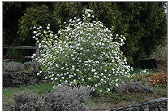
Koreanspice Viburnum in bloom

Koreanspice Viburnum is recommended for the following landscape applications;