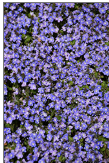
Crystal River Speedwell flowers