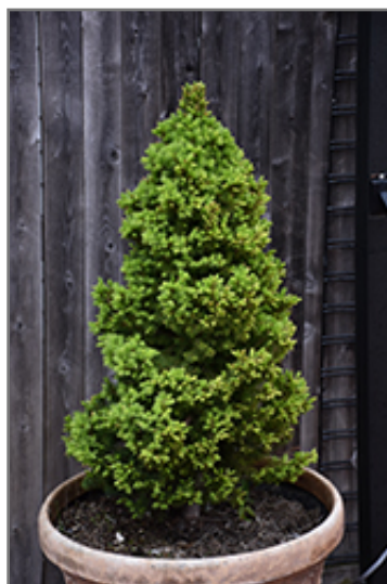
Rainbow's End Spruce