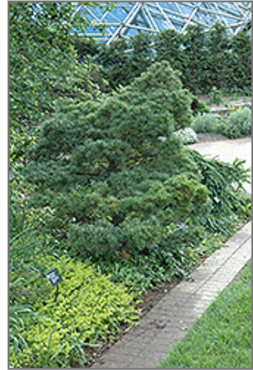
Macopin Eastern White Pine

This shrub should only be grown in full sunlight. It is very adaptable to both dry and moist growing conditions, but will not tolerate any standing water. It is not particular as to soil type, but has a definite preference for acidic soils, and is subject to chlorosis (yellowing) of the foliage in alkaline soils. It is quite intolerant of urban pollution, therefore inner city or urban streetside plantings are best avoided, and will benefit from being planted in a relatively sheltered location. This is a selection of a native North American species.