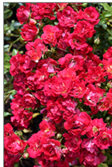
Red Drift Rose flowers

Red Drift Rose is recommended for the following landscape applications;