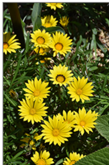
Colorado Gold Gazania flowers

Colorado Gold Gazania is recommended for the following landscape applications;