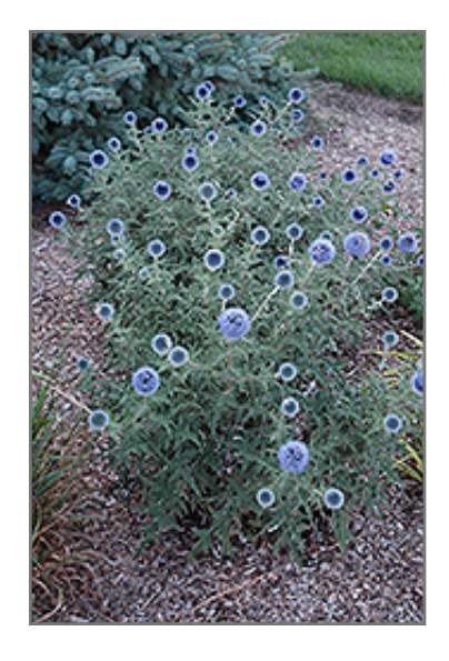
Blue Glow Globe Thistle in bloom