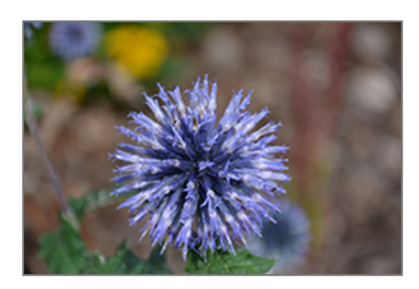
Blue Glow Globe Thistle flowers

This plant should only be grown in full sunlight. It prefers dry to average moisture levels with very well-drained soil, and will often die in standing water. It is considered to be drought-tolerant, and thus makes an ideal choice for a low-water garden or xeriscape application. It is particular about its soil conditions, with a strong preference for poor, alkaline soils. It is somewhat tolerant of urban pollution. This is a selected variety of a species not originally from North America. It can be propagated by division; however, as a cultivated variety, be aware that it may be subject to certain restrictions or prohibitions on propagation.