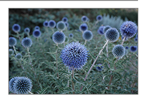
Blue Glow Globe Thistle flowers