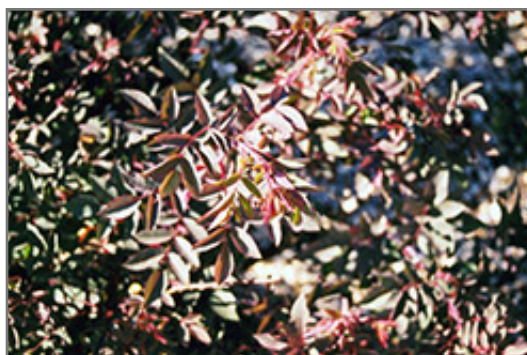
Red Leaf Rose foliage