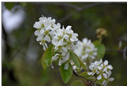
Saskatoon flowers

Saskatoon is a multi-stemmed deciduous shrub with an upright spreading habit of growth. Its relatively fine texture sets it apart from other landscape plants with less refined foliage.