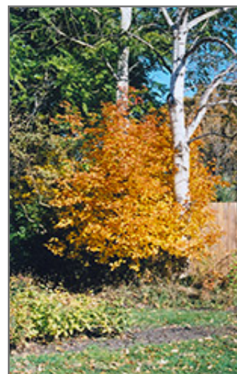
Saskatoon in fall