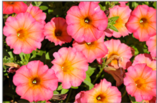
Crazytunia Mayan Sunset Petunia flowers