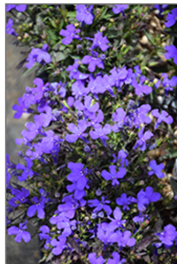
Crystal Palace Lobelia flowers