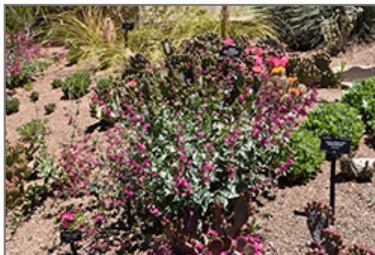
Desert Beard Tongue in bloom