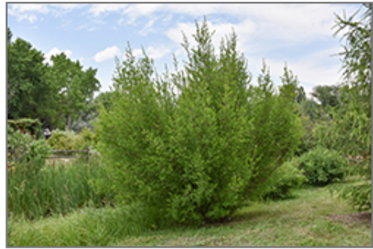
New Mexico Privet

New Mexico Privet is recommended for the following landscape applications;