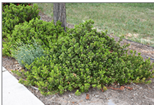
Panchito Manzanita