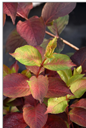
Midnight Sun Reblooming Weigela foliage