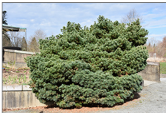
Blue Shag White Pine