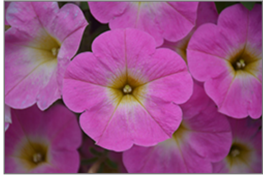
Sweetunia Pink Lemonade Petunia flowers

Sweetunia Pink Lemonade Petunia is recommended for the following landscape applications;