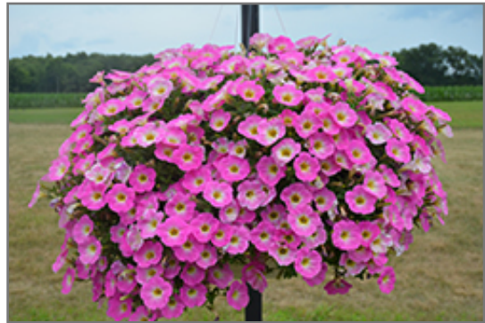
Sweetunia Pink Lemonade Petunia in bloom