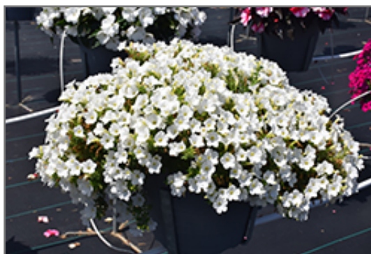
Itsy White Petunia in bloom