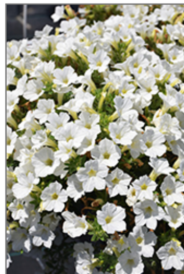
Itsy White Petunia flowers

Itsy White Petunia is recommended for the following landscape applications;