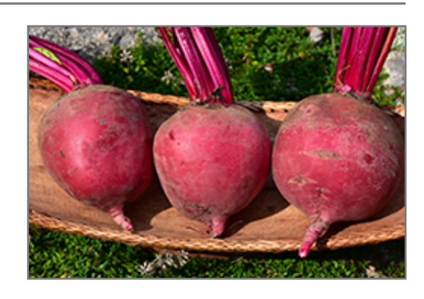
Candy Cane Beet fruit

Candy Cane Beet will grow to be about 10 inches tall at maturity, with a spread of 12 inches. When planted in rows, individual plants should be spaced approximately 4 inches apart. This fast-growing vegetable plant is an annual, which means that it will grow for one season in your garden and then die after producing a crop. Because of its relatively short time to maturity, it lends itself to a series of successive plantings each staggered by a week or two; this will prolong the effective harvest period.