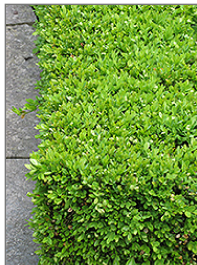
Green Velvet Boxwood foliage