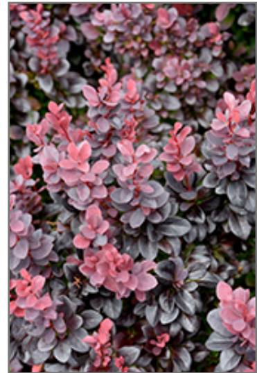
Concorde Japanese Barberry foliage