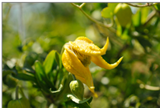
Little Lemons Clematis flowers