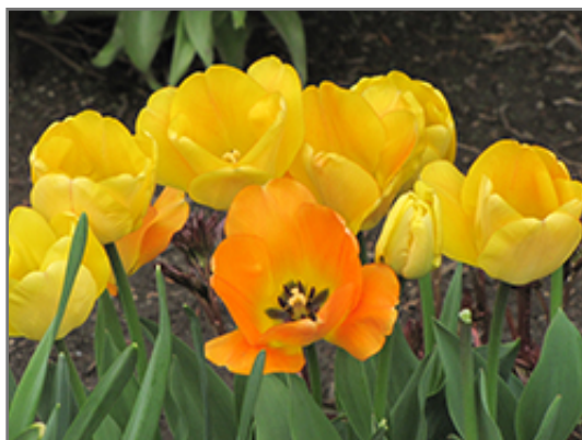
Daydream Tulip in bloom