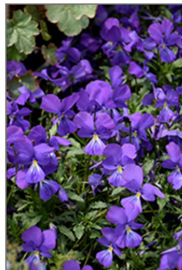
Corsican Pansy flowers

Corsican Pansy is recommended for the following landscape applications;