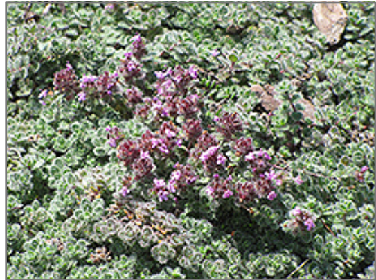
Wooly Thyme flowers