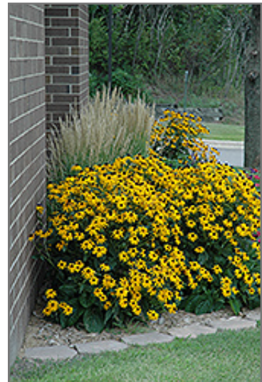
Goldsturm Coneflower in bloom