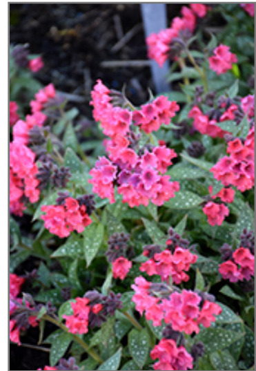
Shrimps On The Barbie Lungwort flowers

Shrimps On The Barbie Lungwort is recommended for the following landscape applications;