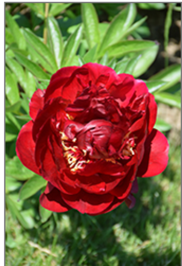
Buckeye Belle Peony flowers