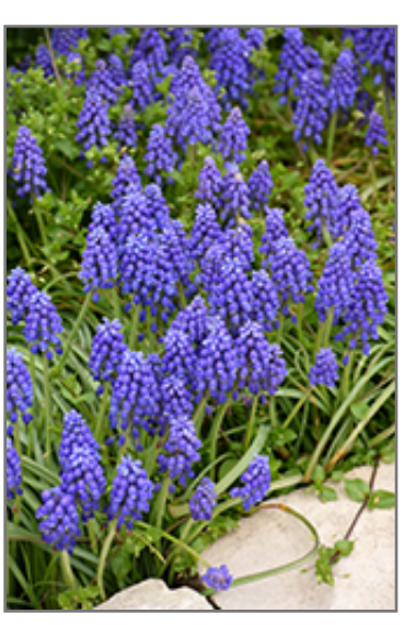
Grape Hyacinth flowers

This plant should only be grown in full sunlight. It does best in average to evenly moist conditions, but will not tolerate standing water. It is not particular as to soil type or pH. It is somewhat tolerant of urban pollution. This species is not originally from North America. It can be propagated by multiplication of the underground bulbs.