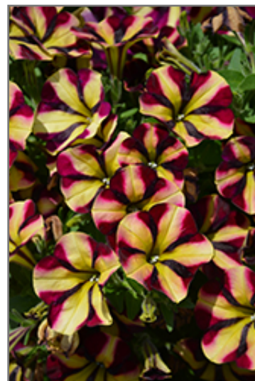
Amore Fiesta Petunia flowers

Amore Fiesta Petunia is recommended for the following landscape applications;