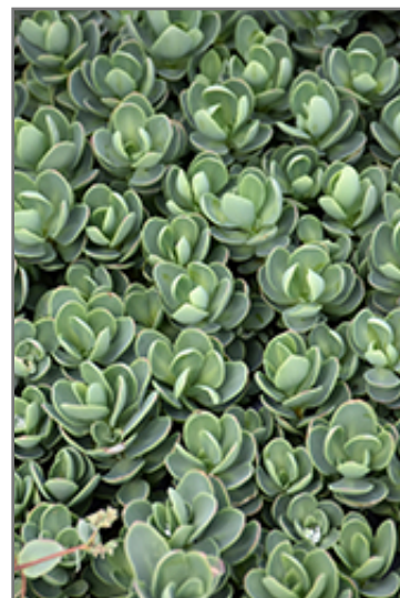
Pink Mongolian Stonecrop foliage

Pink Mongolian Stonecrop is a fine choice for the garden, but it is also a good selection for planting in outdoor pots and containers. It is often used as a 'filler' in the 'spiller-thriller-filler' container combination, providing a mass of flowers and foliage against which the thriller plants stand out. Note that when growing plants in outdoor containers and baskets, they may require more frequent waterings than they would in the yard or garden.