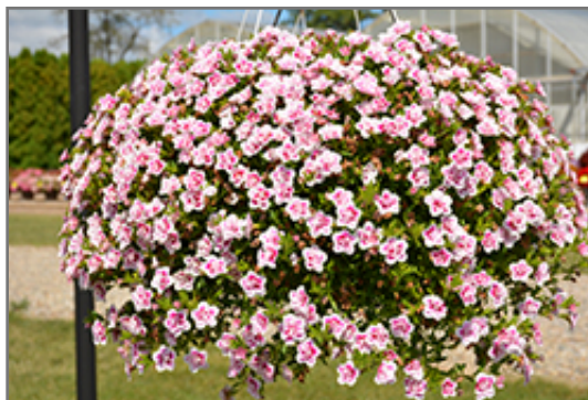
MiniFamous Uno Double PinkTastic Calibrachoa in bloom

MiniFamous Uno Double PinkTastic Calibrachoa is a fine choice for the garden, but it is also a good selection for planting in outdoor containers and hanging baskets. Because of its trailing habit of growth, it is ideally suited for use as a 'spiller' in the 'spiller-thriller-filler' container combination; plant it near the edges where it can spill gracefully over the pot. Note that when growing plants in outdoor containers and baskets, they may require more frequent waterings than they would in the yard or garden.