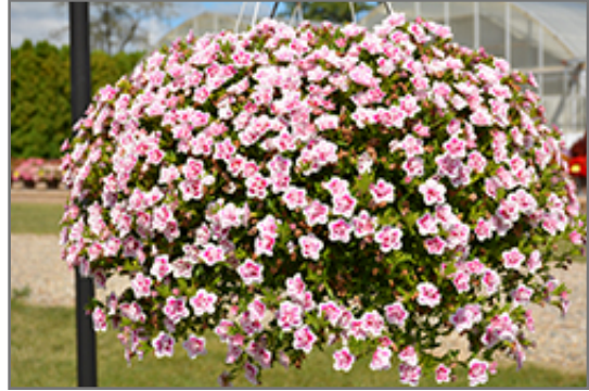
MiniFamous Uno Double PinkTastic Calibrachoa in bloom

MiniFamous Uno Double PinkTastic Calibrachoa is a fine choice for the garden, but it is also a good selection for planting in outdoor containers and hanging baskets. Because of its trailing habit of growth, it is ideally suited for use as a 'spiller' in the 'spiller-thriller-filler' container combination; plant it near the edges where it can spill gracefully over the pot. Note that when growing plants in outdoor containers and baskets, they may require more frequent waterings than they would in the yard or garden.