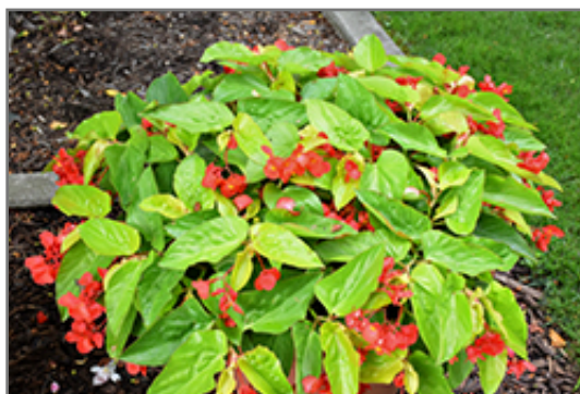
Canary Wings Begonia in bloom